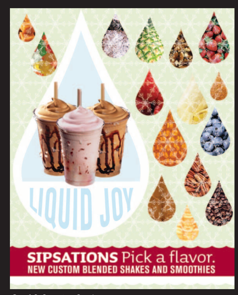
8 x 10 Counter Card

LIQUID JOY - This concept uses drops of liquid to represent the many flavors that can be combined to create customized Cold Stone shakes and smoothies.