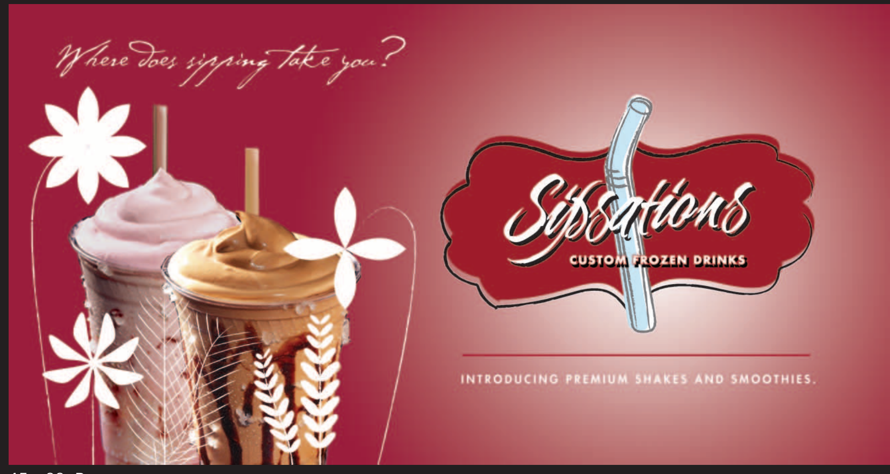
45 x 22 Banner

Illustrations keep look soft and fresh for a spring- summer launch.