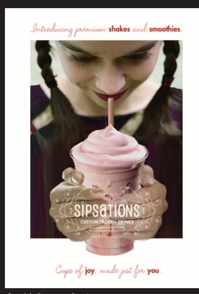
8 x 11 Counter Card

"I want a feeling of complete joy to break through the chaos and cover me in a blanket of creamy soft goodness. I want to taste all my favorite things, like raspberries and chocolate and coconut. I want waves of flavor to fill my entire body and awaken my senses. I want a sweet temptation, made just for me."