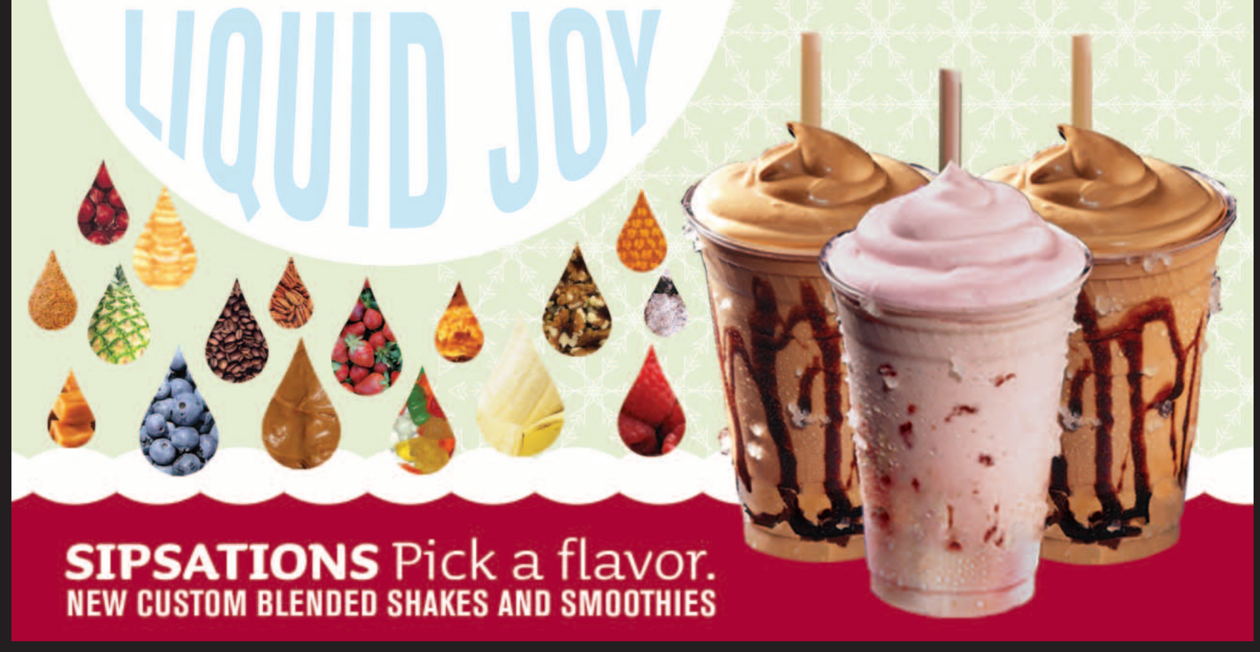
45 x 22 Banner